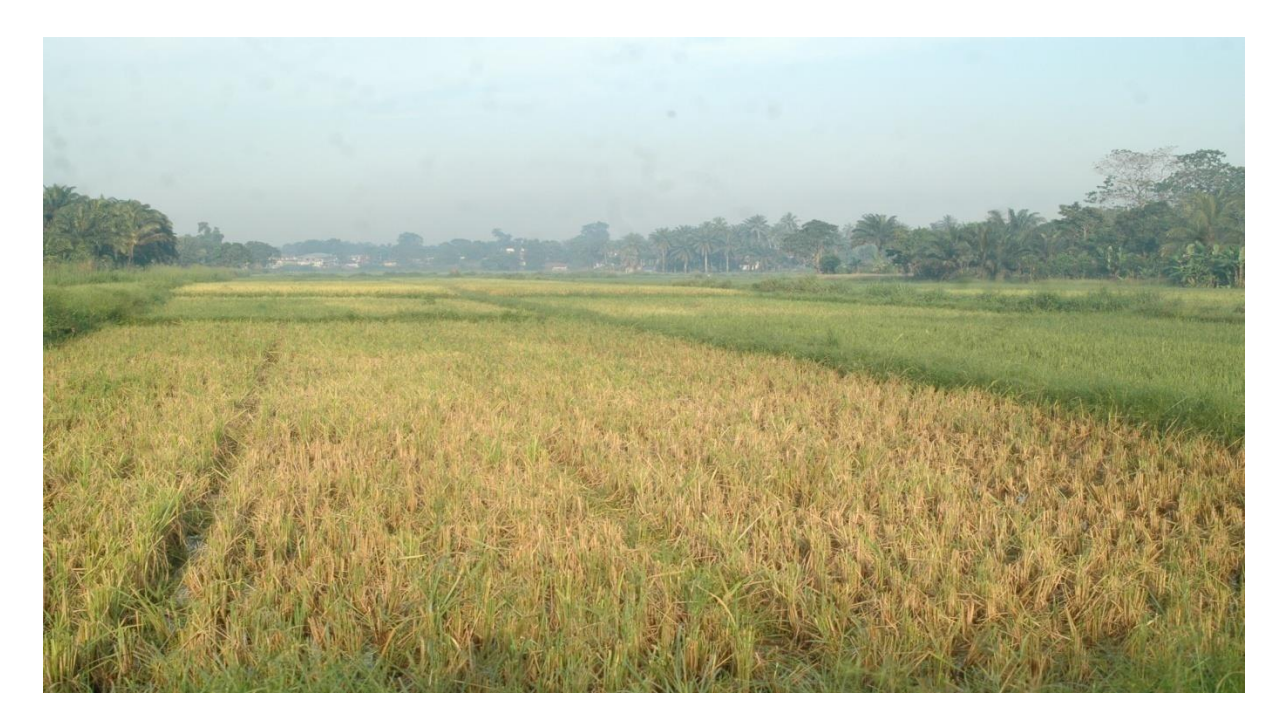
ANNEX 3 (c): Demonstration plots at China farm in Bo town.