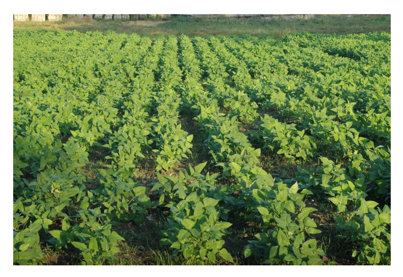
ANNEX 6 (c): One of the demonstration plots with Soya beans in the Lambaiama Training Centre- Kenema.