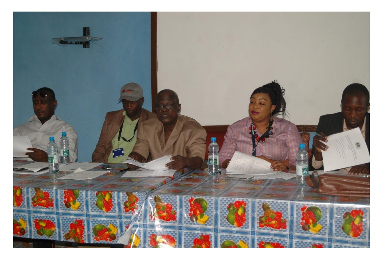
ANNEX 3 (b): Meeting with Officials of MAFFS in Bo Town.