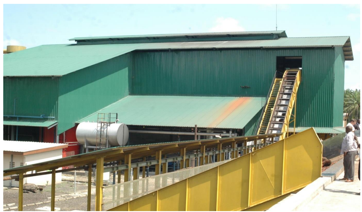
ANNEX 5 (b): Gold Tree's Oil Mill ready for processing in Daru town.