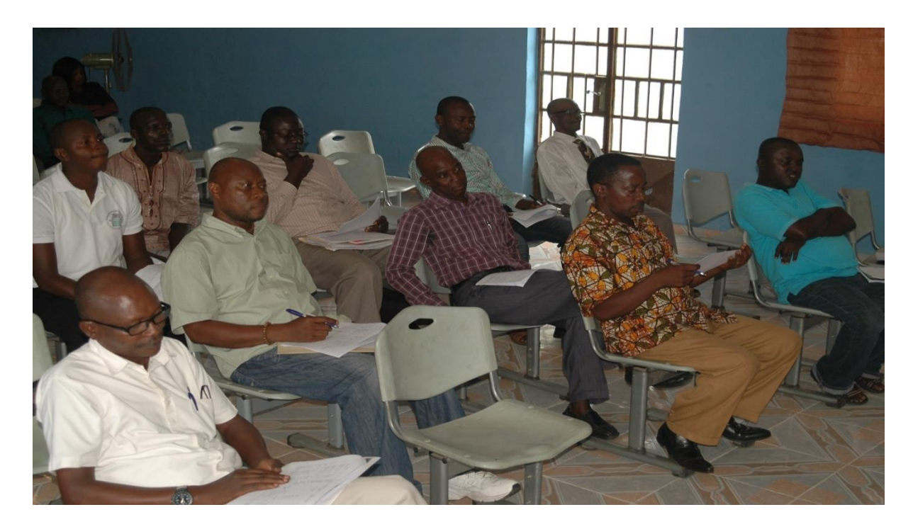
ANNEX 3(a): DAO of Bo District making his presentation.