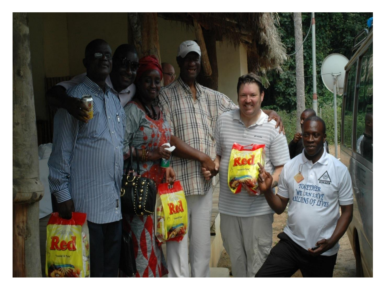
ANNEX 5 (c): General Manager of Gold Tree presenting sample of their product to the Committee.