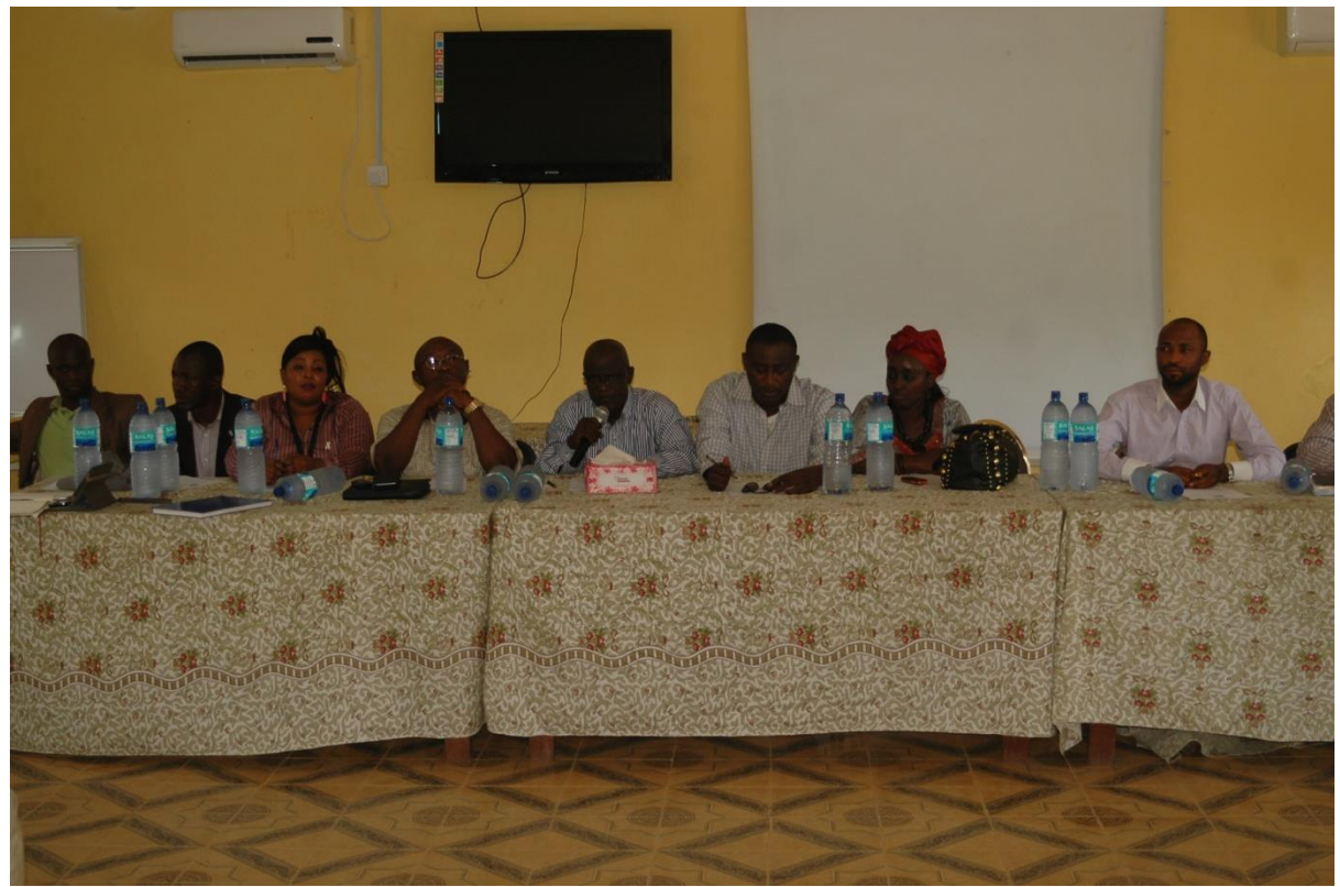
ANNEX 6 (a): Meeting with MAFFS's Officials in Kenema.