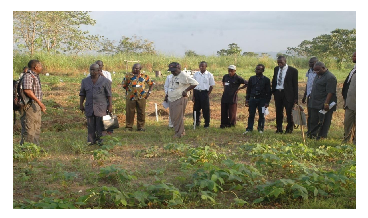
ANNEX 2 : Committee on site visit at SLARI's experimental site – Magbosie.