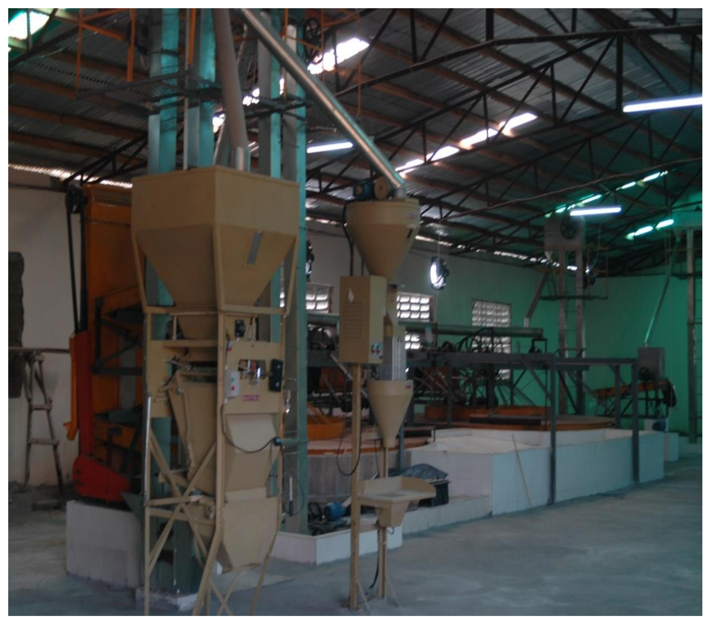
ANNEX 7 (A): Cassava processing machine at Gpomoron, Lunsar- Makeni highway.