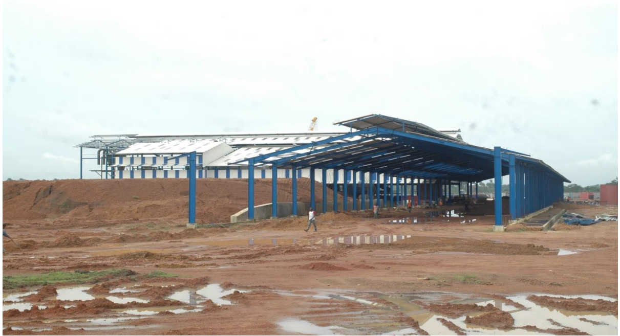
ANNEX 4 (c): Socfin's Mill construction site.

ANNEX 4 (b): Socfin's oil palm nursery site.